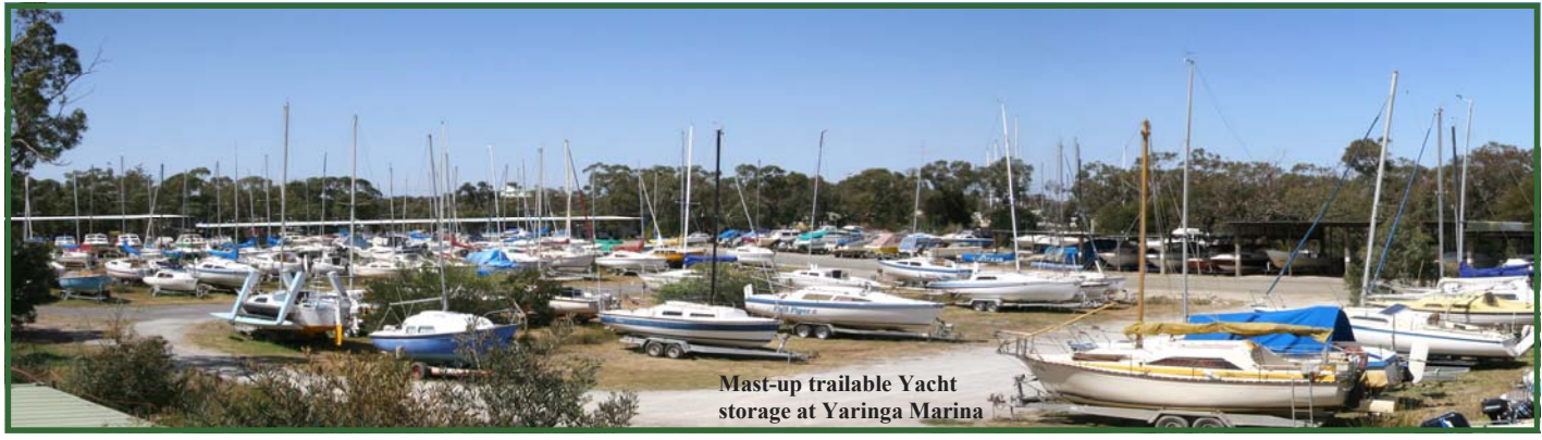
Mast-up trailable Yacht storage at Yaringa Marina